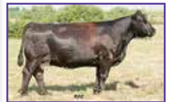
LHT Ms. Blackfoot 177G, Grandam