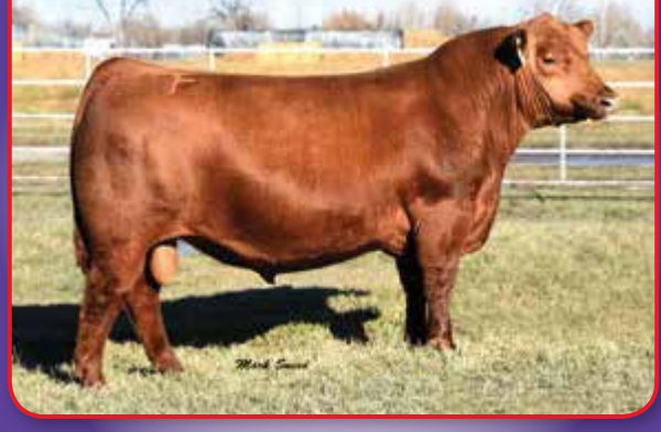
H2R Profitbuilder B403, AI Sire