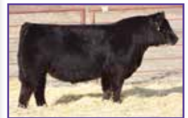
W/C Executive187D, AI Sire