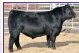
CCR Anchor 9071B, AI Sire