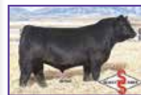
Koch Big Timber 685D, AI Sire