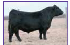
W/C Executive Order 8543B, Sire