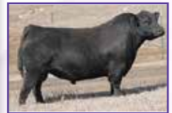
JSAR Titan, AI Sire