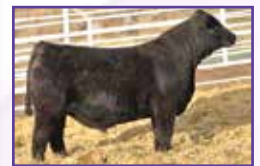
TJ Franchise 451D, AI Sire