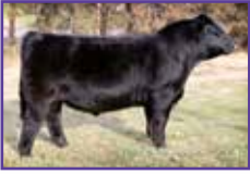
LHT Making Tracks 03C, Sire