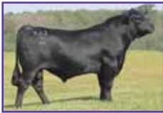
GAR Sure Fire, AI Sire