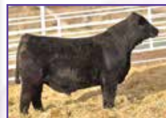
TJ Franchise 451D, AI Sire