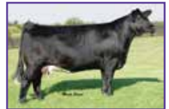
KenCo Miley Cottontail, Dam