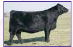
BWL Ginger 930Y, Dam