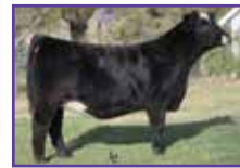
WWS Antoinette 22B, Dam