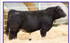
LHT Mr. Lock Down 36D, AI Sire