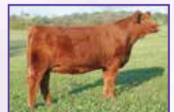
Lazy H Miss Remington, Grandam