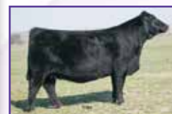
BWL Ginger 930Y, Dam