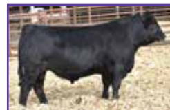
Hook's Beacon 56B, AI Sire