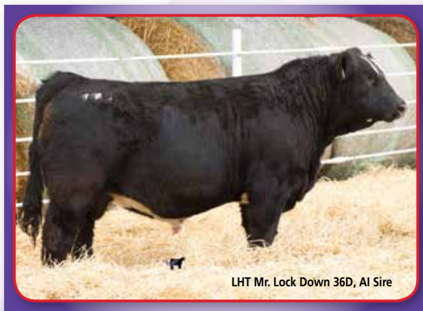
LHT Mr. Lock Down 36D, AI Sire