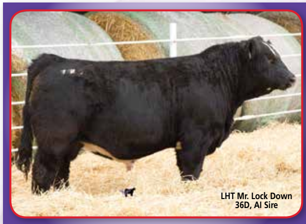
LHT Mr. Lock Down 36D, AI Sire