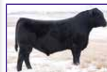
Hook's Encore 65E, AI Sire