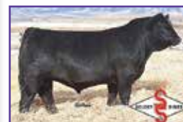
Koch Big Timber 685D, AI Sire