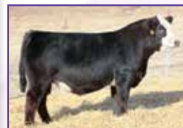
W/C Lock Down 206Z, AI Sire