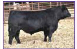
Hook's Beacon 56B, AI Sire