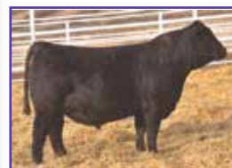
TJ Diplomat 294D, AI Sire