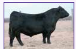
W/C Executive Order 8543B, Sire