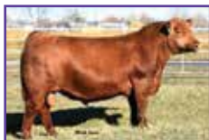
H2R Profitbuilder B403, AI Sire