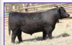
JSAR Kansas, AI Sire