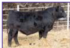
LHT Mr. United 57C, Sire